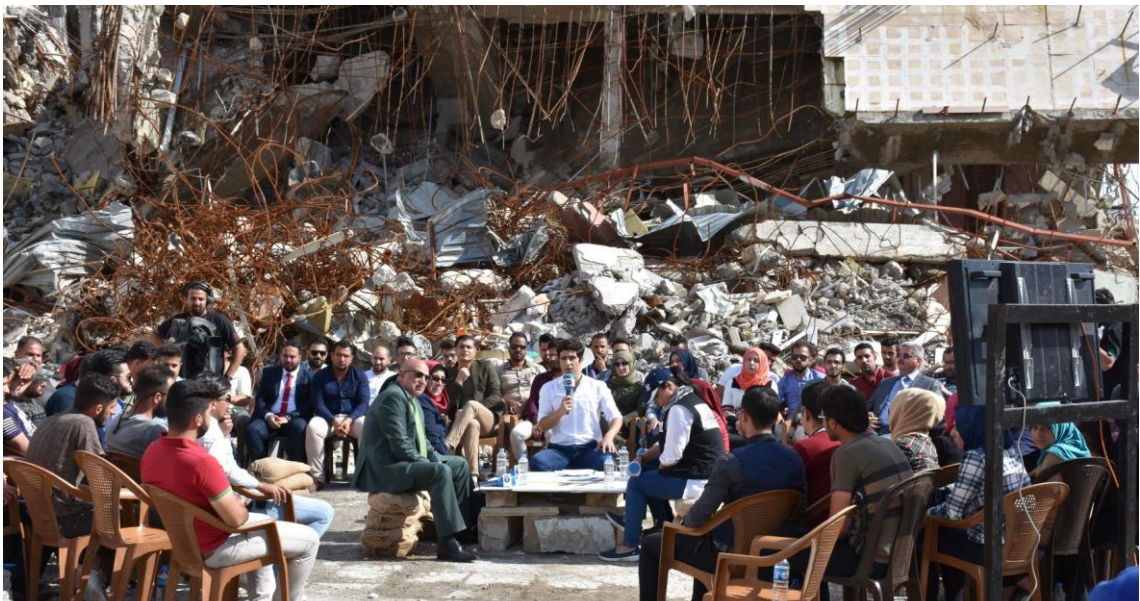
Photo: Discussion with citizens and Iraqi leaders live from destroyed Mosul in June 2018